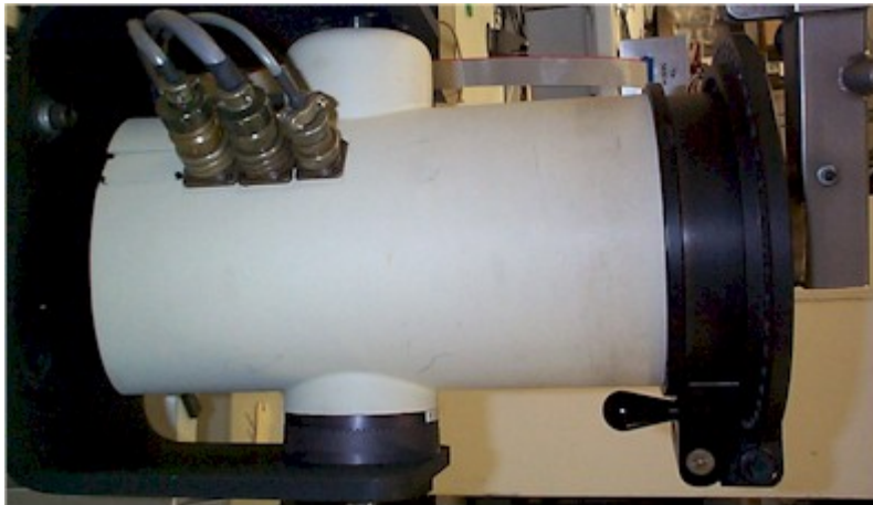
Figure 2 - Three Connector NORM

_____ I have a three metal connector dynamometer.