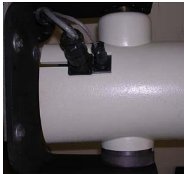
Figure 1 - Two Connector NORM

_____ I have a two black plastic connector dynamometer.